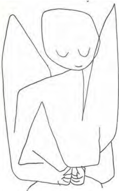
Forgetful Angel, Paul Klee (1939)

How is it then necessary to proceed? An hypothesis is that novelty is neither a speech without action, nor an action without speech, but an intertwining of speech and action. But how can this intertwining be accessed?