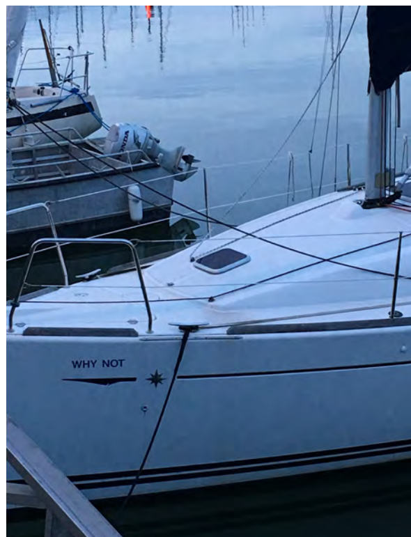
Le Why not, Deauville (2018)