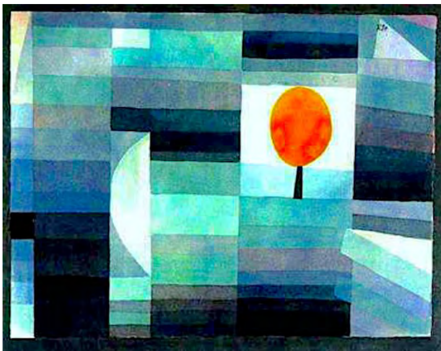
Harbinger of autumn, Paul Klee (1922)

and dead metaphor: metaphor is interesting only when it is alive—provoking surprise and shock, indicating new thought. When this creativity is exhausted either by paraphrase or by persistent use so that what is metaphoric becomes literal in a new context, the metaphor is dead” (Hesse, 1988, p. 4).